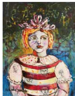
2018 winning art by Ardith Goodwin