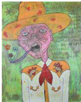
2020 winning art by Abe Partridge