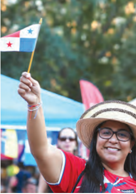
Mobile Latin Fest, 2021