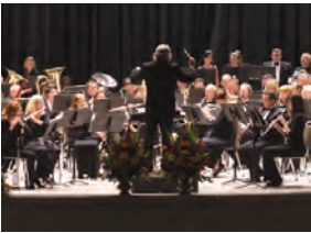
Mobile Symphonic Pops