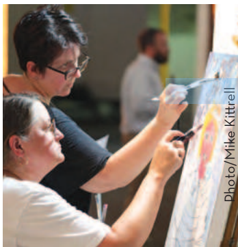
The Throwdown, 2018